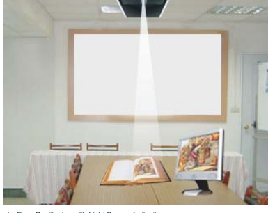
Easy Positioning with Light Square Indication

The light source is projected in 16-degree angles onto the working surface. It reduces any potential of getting reflection, shade or hot spot, which commonly associated, with other type of light sources.