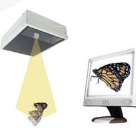
▲ 20 fps Live Progressive Output

CL500 captures videos at 20 frames per second. User can enjoys a real-times live image output with less flickering compares to other 15 fps unit.