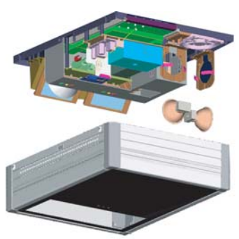
▲ Easy Install and Maintenance

All connections are placed on the topside of the camera so it can be easily installed. The main cover can be removed without special tools in case of lamp replacement.