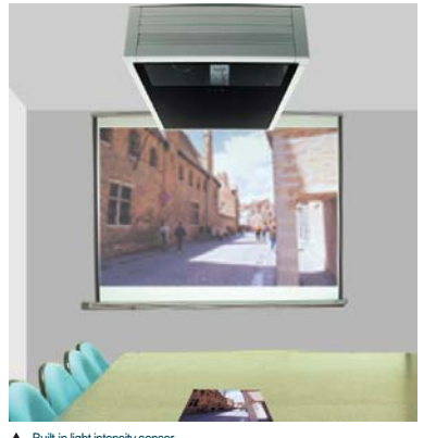
Built-in light intensity sensor

CL500 projects a uniformed light source from the camera body onto the working surface to indicate the shooting area. Any objects can be easily placed in the working surface for captures.