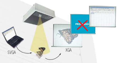
▲ Seamless Switch Between PC and Camera Video Output

The CL500 has built-in seamless video switches, which enable seamless output video source switching between the live video from the camera and the RGB input commonly used for computer video pass-through. Seamless switching means no flickering during the video source switching. The audiences will enjoy a smoother presentation.