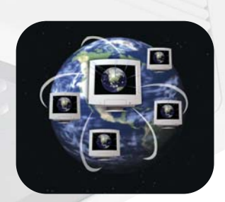
▲ Built-in Ethernet connection

The CL500 comes with an Ethernet connection for easier integration into a computer network for remote control purpose. Programming Ethernet is much easier than the RS-232. Cabling also less expensive compares to RS-232 cable with longer cable run allowance.