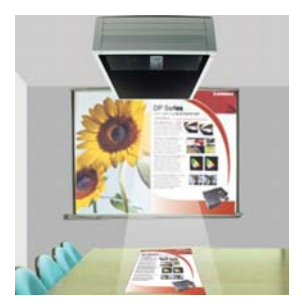
▲ Split Screen for Side by Side Image Display

The CL500 can display two images side-by-side at the same time for comparison. These two images can be one from current live camera and the other from the built-in image memory. Built-in images can also be pan as desired.